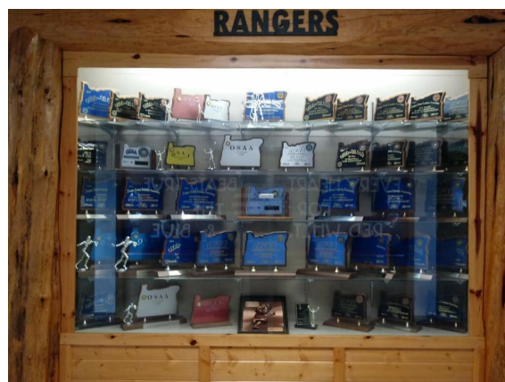
Photo: Dufur 10 Time State Champions