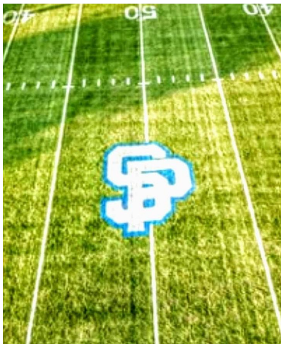
Photo: St. Paul Buckaroos 376 Wins in 44 Years