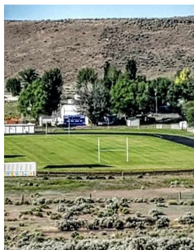
Photo: Crane Mustangs 377 Wins in 60 Years

-24 schools win 61 State Championships in 62 years -1966 and 1982 had Co-Champions -2020 no State Champion crowned due to global pandemic