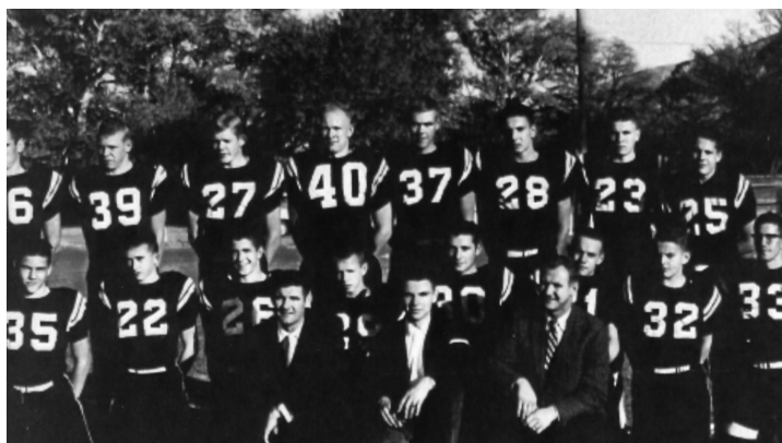
Photo: 1960 Lone Cardinals - inaugural 8-man state champions