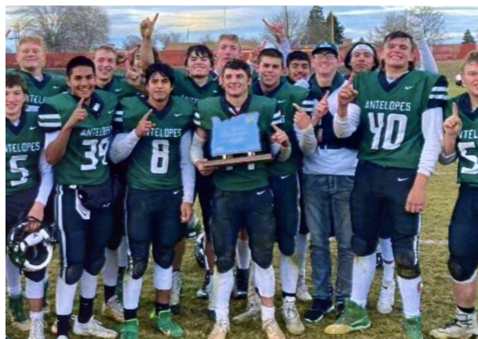
2021 OSA 8-man state champions