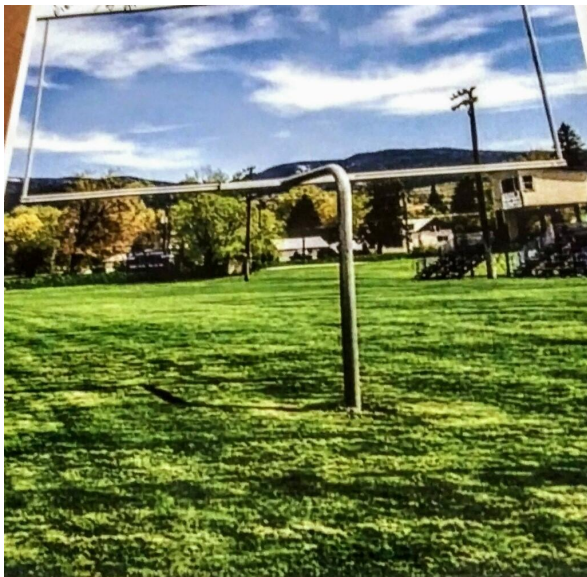
Photo: Cove Football Field. 5 Time State Champions

Camas Valley started in the 80's by beating Arlington. Arlington came back in 1981 to win the state championship with Prospect being runner-up. 1982 saw Prospect break a string of second place finishes by winning a co-state title with Cove. This was Cove's first title with many more to come in the 1980's. Cove goes back to back winning in 1983, defeating Valsetz (closed), Valsetz's one and only title appearance. St. Paul defeated Cove in 1984, marking St. Paul's first state title. In 1985 Cove defeated St. Paul as well as in 1987. In 1986 Butte Falls defeats Cove. 1988 saw Paisley make its first and only title appearance, losing to Cove. That year was Cove's 7th straight title game from 1982-88, a Oregon High School state football record. Sherman Co. closed the decade by defeating Alsea in 1989. In O8MFH the 80's saw Cove arguably have the best decade ever going 104-13-1.