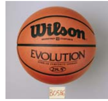
Wilson Evolution B0586 (women's)