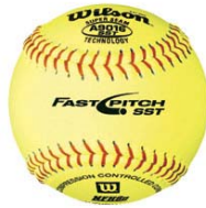
Wilson A9016 BSST (COR .47) Optic yellow leather with red stitch Cork center – 375 lbs. max compression Softballs must include all three stamps to be legal: NFHS, COR, Compression