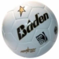
Baden Elite SX 651/751