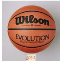
Wilson Evolution B0516 (men's)