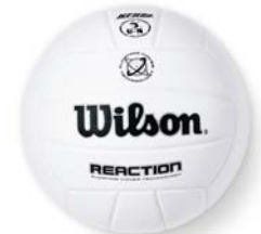
Wilson Reaction H7500

Schools are reminded that the OSAA requires schools to use officially adopted championship balls during all state championship contests, first round through final games.