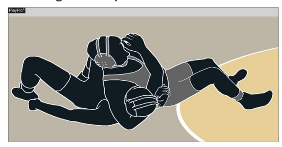
5.15.2c . Near-fall points or fall shall be earned only while the supporting points of either wrestler are inbounds. In a pinning situation, when all parts of the defensive wrestler's shoulders/scapula are on the mat beyond the boundary line, if the feet including toes and heels of the offensive wrestler are the supporting points, the offensive wrestler's knee(s) must be inside the boundary, whether in contact with or above the mat.

The position of the offensive wrestler during near falls and falls has changed. There is now a "cylinder" going straight up from the out of bounds line. During pinning situations, if the defensive wrestler is out of bounds, the offensive wrestler shall have BOTH knees on or inside the "cylinder" for wrestling to continue. Once a knee of the offensive wrestler extends beyond the out of bounds "cylinder" area, the wrestlers are out of bounds. The offensive wrestler does not get to try and correct this. Once they are out, wrestling will stop.