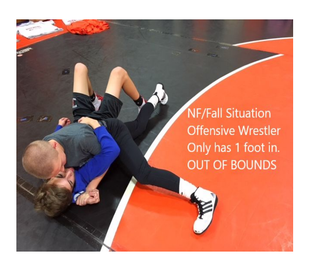
OUT OF BOUNDS Offensive Wrestler Has Only 1 Foot In