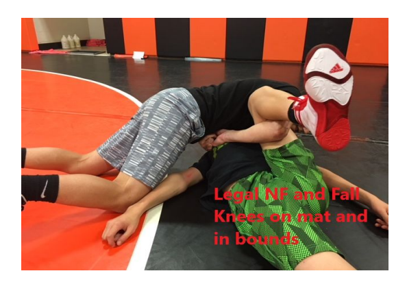
OFFENSIVE WRESTLER IN BOUNDS