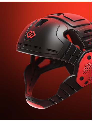
LEGAL ear guards (LDR)