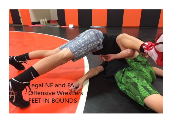
OFFENSIVE WRESTLER IN BOUNDS