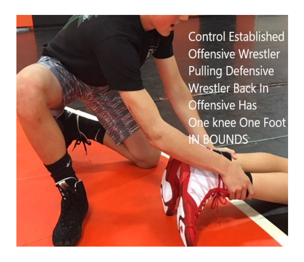
OFFENSIVE WRESTLER IN BOUNDS